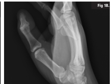
Fig 1B. Lateral radiograph demonstrating angulated and malrotated 5th metacarpal shaft fracture.