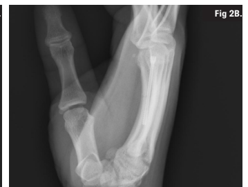
Fig 2B. Lateral radiograph demonstrating anatomic reduction of 5th metacarpal and fixation with intramedullary BioPro HBS screw. Note dorsal entry point of screw in metacarpal head.