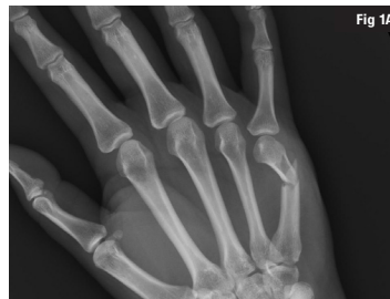
Fig 1A. AP radiograph demonstrating an unstable displaced and angulated 5th metacarpal shaft fracture.

A single 1 cm incision is made over the metacarpophalangeal joint and the extensor tendon is split in line with its fibers. Then, a limited arthrotomy is made exposing the metacarpal head articular surface. A closed reduction is performed and the 0.9 mm guidewire for the BioPro HBS ® Headless Screw System is advanced through the dorsal 1/3rd of the metacarpal head in line with the medullary canal and across the fracture site (alternatively, the guidewire can be used as a joystick to assist in fracture reduction). For complex fractures, a small dorsal incision can be made to facilitate direct reduction. The guidewire is over-drilled and the length of the screw is measured. Fluoroscopy is used to determine optimal depth of the wire. A 2.5 or 3.0 mm cannulated self-drilling and self-tapping (SDST) screw is selected based on pre-operative templating and advanced across the fracture site (Fig 1a and 1b). The arthrotomy, extensor tendon, and skin are repaired in the usual fashion. Post-operatively, sutures are removed after 7-10 days and active motion is started at the first post-operative visit. This is followed by passive motion at week 3 and light strengthening at week 4. Union is typically achieved by week 6 6 (Fig 2a and 2b).