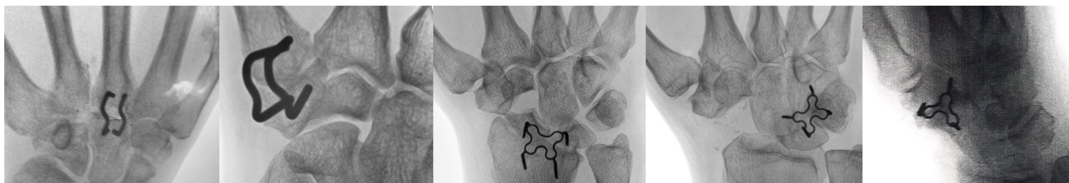
Metacarpal/Capitate Fusion Memory Staple