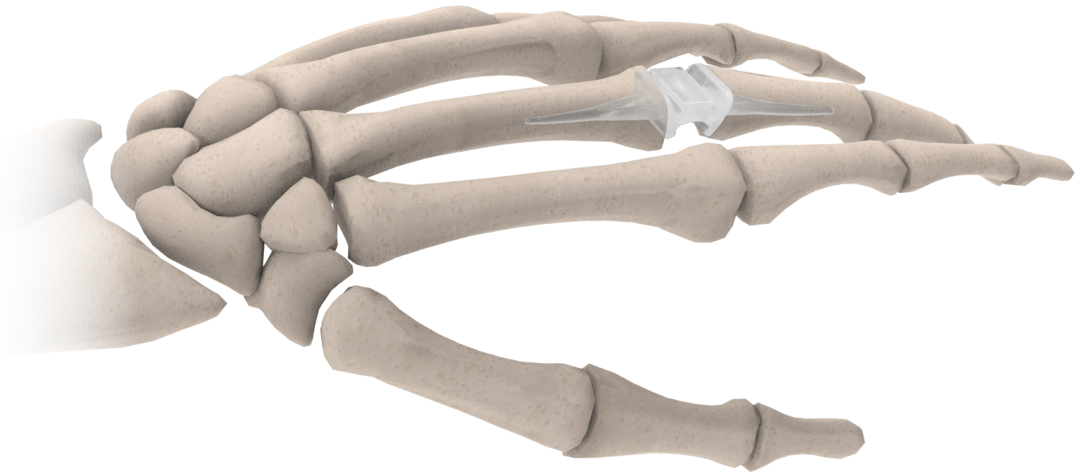
5 Sizes MCP

A modern silicone spacer for MCP and PIP joint replacement.