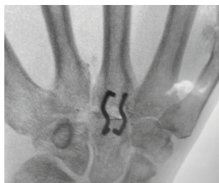
Metacarpal/Capitate Fusion Memory Staple