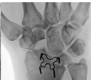
Radioscapholunate Fusion Clover Staple™