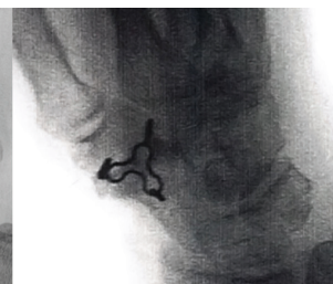
Scaphotrapeziotrapezoid Fusion Clover Staple™