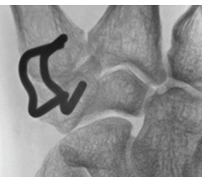
Carpometacarpal Fusion Memory Staple