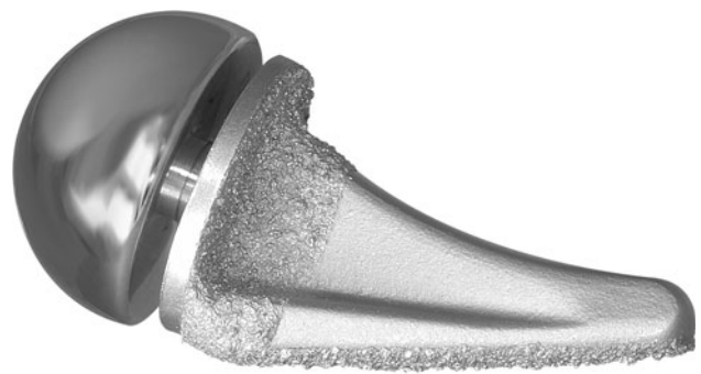
Fig. 1 A photograph shows the BioPro® Modular Thumb.

This report describes our results using this implant design. Our aims were to (1) assess pain relief and functional improvement and preservation of the appearance of the thumb as reflected by improved Buck-Gramcko scores [5]. (2) We also wished to radiographically assess the prosthetic reconstruction during followup and (3) document what complications occur with the use of this