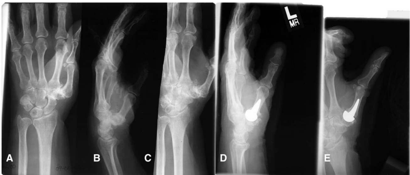
Fig. 2A–E Preoperative (A) posteroanterior, (B) lateral, and (C) oblique radiographs show the left hand and wrist of a 63-year-old woman with Eaton-Littler Stage III arthritis of the basal joint of the

thumb. (D) Lateral and (E) posteroanterior radiographs show the left hand and wrist 72 months after implant arthroplasty of the left thumb basal joint.